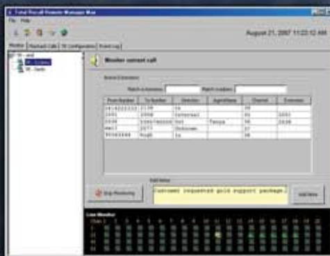
Remote Manager PC Client Interface

Remote Manager can also be used to add notes to calls in real time, which can later be used as a search parameter in conjunction with time, date, channel, extension, call direction, number called or CLI (where transmitted).