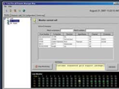
Remote Manager PC Client Interface

Remote Manager can also be used to add notes to calls in real time, which can later be used as a search parameter in conjunction with time, date, channel, extension, call direction, number called or CLI (where transmitted).